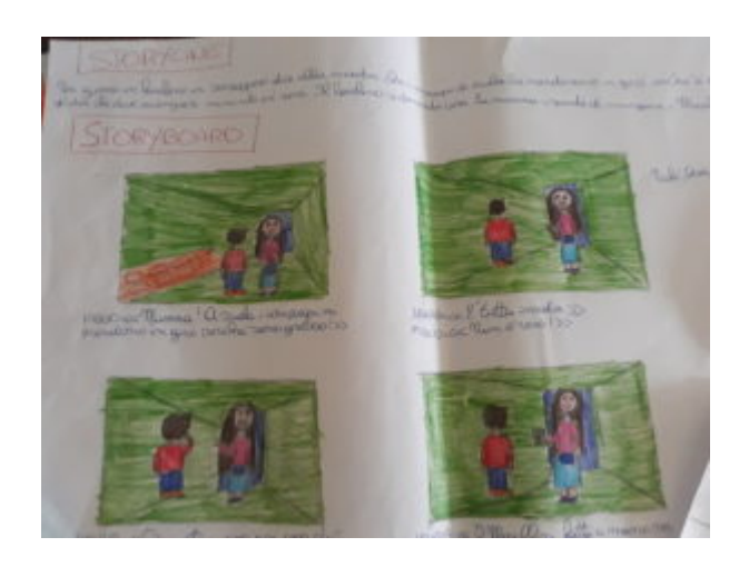
TO BE CONTINUED.....

Here is the link to the whole learning experience!