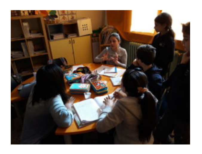
From the "storyline" to the "storyboard"