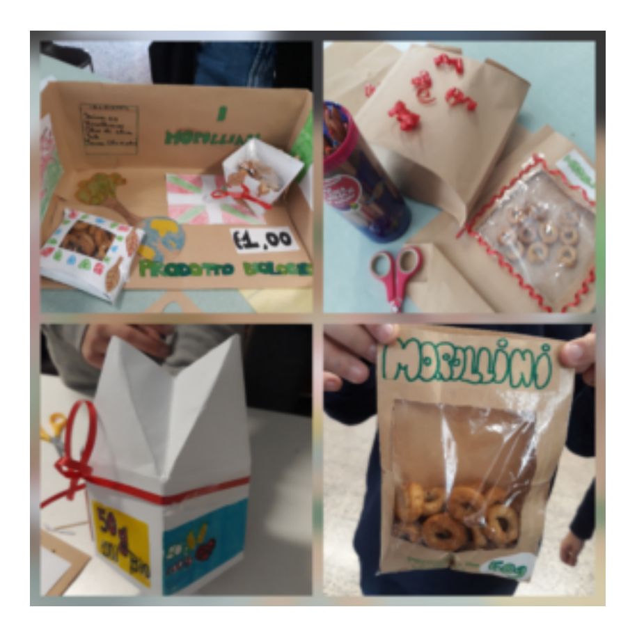
The experience has been great!

At the end, with the help of the low secondary school students, their tutor during the activity, they made a lot of different "packaging" proving their "entrepeneurial skills"!