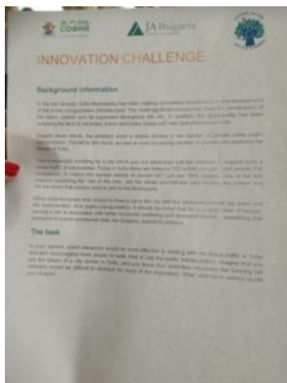
Innovation Challenge – Instruction

proposed by the Municipality of Sofia, was that of public mobility and atmospheric pollution due to private mobility.