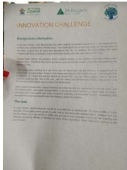
Innovation Challenge – Instruction

proposed by the Municipality of Sofia, was that of public mobility and atmospheric pollution due to private mobility.