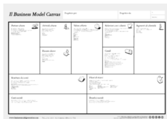
The Business Model Canvas No-Profit

https://strategyzer.com/canvas/business-model-canvas