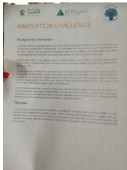
Innovation Challenge – Instruction

The Junior Achievement in Sofia organized a Challenge. Groups of teachers participating in the ERASMUS + project, together with several students of a high school in Turin (present in Sofia to carry out an educational project, financed by the European Community, in the entrepreneurial field) collaborated to find a business model on a specific topic. The theme, proposed by the Municipality of Sofia, was that of public mobility and atmospheric pollution due to private mobility.